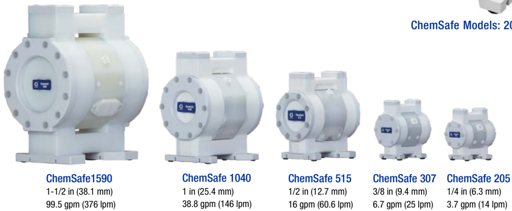
ChemSafe 1590 1-1/2 in (38.1 mm) 99.5 gpm (376 lpm)